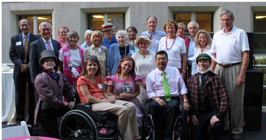
MEMBERS OF THE 135 TH ANNIVERSARY COMMITTEE joined by the Mad Hatter, Alice and the White Rabbit at the Inglis Garden Party.