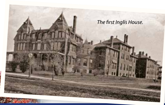
The first Inglis House.

Since 1877, Inglis' mission has remained constant. How that mission is delivered has evolved over time as the needs of the disability community and each era's financial realities change. Our next issue of Image commemorates Inglis' rich history—caring for children, cancer patients and people suffering from polio—to our present-day Person-Centered residential nursing facility, housing initiatives and support for those living independently in the community.