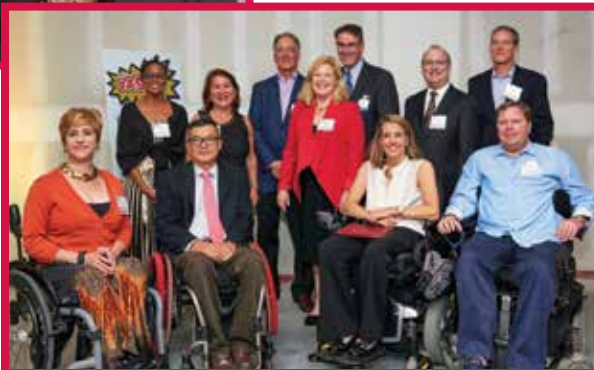
The Inglis Board celebrates at the Bash.