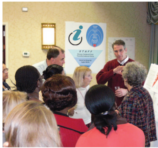
MEMBERS OF THE INGLIS LEADERSHIP team discuss new concepts during a recent training session.

In seeking to promote a culture of excellence, Inglis has adopted new Standards of Excellence based on LIST ONE values. These values – Learn, Integrity, Service, Teamwork, On Time/ On Budget, No Excuses/No Blame and Excellence – have been presented to staff in a variety of forums and formats. They serve as a touchstone for employees at all levels to connect personal behaviors with the larger