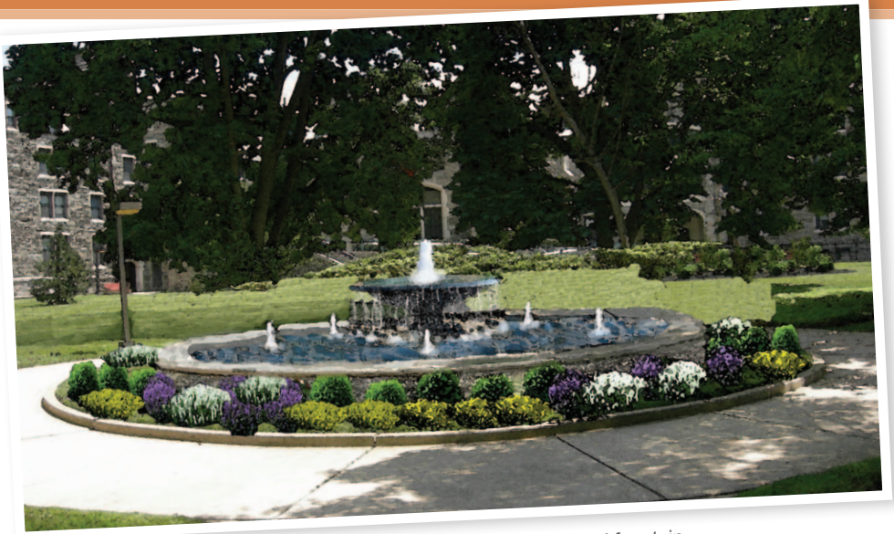
AN ELECTRONIC RENDERING of the proposed Inglis House courtyard fountain.