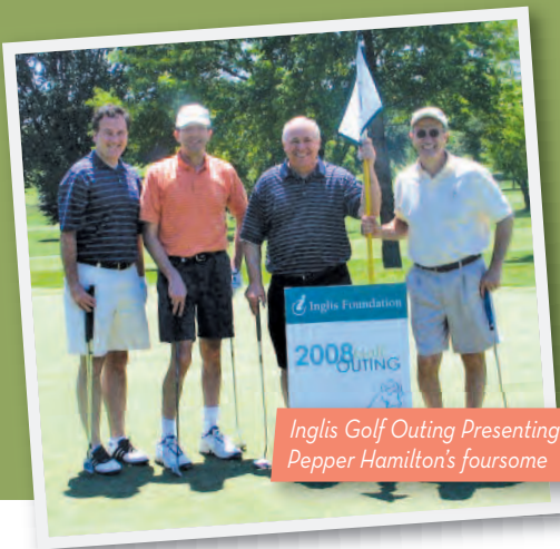
Inglis Golf Outing Presenting Sponsor Pepper Hamilton's foursome

Residents come to Inglis House because it serves the needs of younger adults with physical disabilities by providing a wide variety of quality-of-life programs. These programs are not covered by the usual state and federal funding for nursing homes.